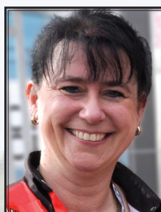
Gittli Koller SG Contingency pro- gram/General contact Germany gittli.koller@ speedgroup.eu